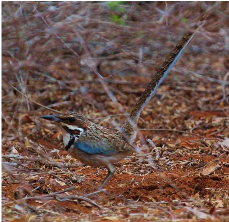
The enigmatic Long-tailed Ground-Roller

Two very special birds here are the near mythical Subdesert Mesite, which we may find adopting its strange, cryptic posture on a thorny branch, and the Long-tailed Ground-Roller, an elusive ground dweller best located by its low, hooting call. This elusive bird is primarily crepuscular in habit and can be extremely difficult to locate, but by rising early and working the forest at dawn we have a good chance of seeing it. Local villagers who specialize in showing visitors the Long-tailed Ground-Roller will track these through the sandy desert and locate them for us. They track them by their footprints, an amazing feat by a family team. We regularly have superb views of this strange bird, which is somewhat reminiscent of a roadrunner. While looking for the ground-roller and other special birds, we will have the opportunity to see many of the strange plants of the spiny desert. As the day warms up, so too does reptile activity and with a bit of luck we should see the numerous Three-eyed Lizards or a Chameleon species or two. We may be lucky enough to find a beautiful Spider Tortoise, rare Dumeril's Boa or obscure mammals like Lesser Hedgehog Tenrec or day roosting Petter's Sportive-Lemur.