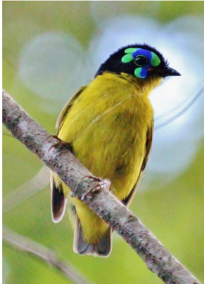
Male Schlegel's Asity

Unique is the adjective most often used to describe Madagascar. This huge island first began to split away from the African continent during the age of the dinosaurs and has since followed an independent evolutionary course, allowing an amazing variety of different life forms to evolve from a few colonizing ancestors. Ranging from the bizarre to the sublime, this is island evolution gone wild, and there is no other destination like it. Few places in the world are as threatened as the native environments of Madagascar and nearby islands. Intense human settlement and population increase for at least 1500 years has led to the destruction of vast areas of the native habitats. Rainforests that once covered the wet eastern slope of the island are now fragmented and mostly inaccessible. While the special spiny forests of the south western coastal strip are still in good shape, there are few protected examples of these restricted habitats. Long gone are the giant lemurs, dwarf hippos, and elephant birds, and today, even the remaining lemurs and native birds, survive precariously. There is a sense of urgency to visiting Madagascar. The country is at a critical turning point and if ample reserves are not created and protected in the near future, many species will soon become extinct. This tour is