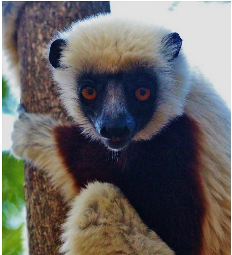
Coquerel's Sifaka