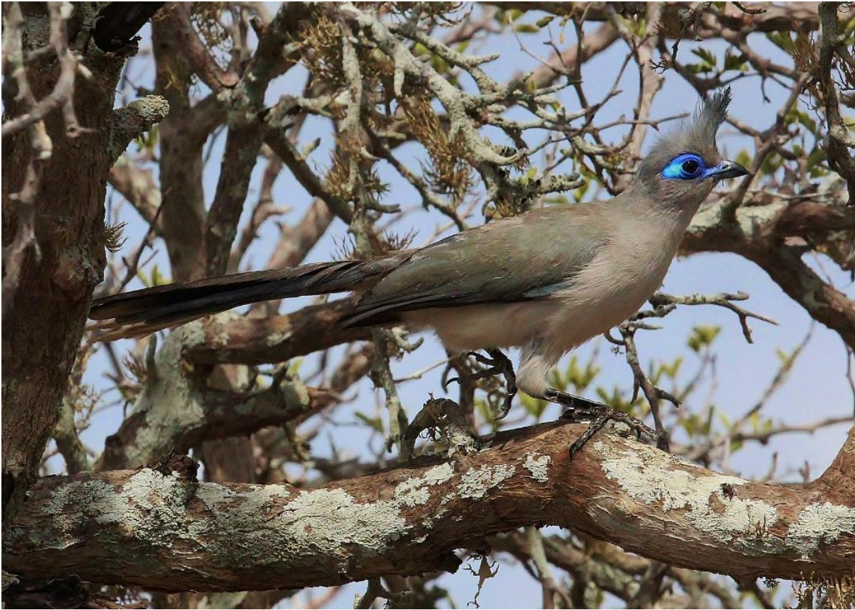
Verreaux's Coua--a challenging-to-find endemic

November 12, Day 8: Anakao to Isalo. In the early morning, we will depart Anakao by boat for Toliara. Here we will explore a small flat-topped mountain aptly known as La Table in search of the recently discovered and increasingly rare and localized Red-shouldered Vanga. The coral scrub is also home to the localized endemic Verreaux's Coua.